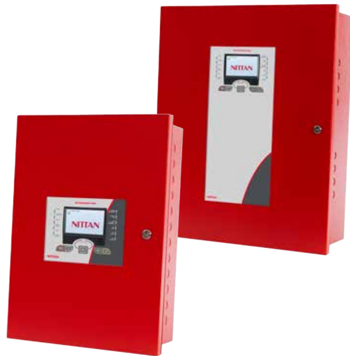
NMP-6 / NMP-10