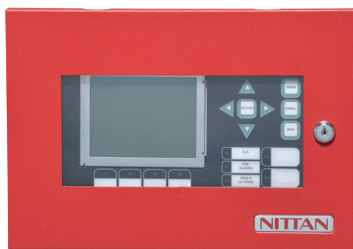
NFU-AN-GL includes a NK-AN-LCDG 640 character (16x40) graphical back-lit LCD display and a NK-AN-BB1R enclosure