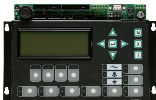
NK-AN-LCD large 80 character (4x20) back-lit LCD display